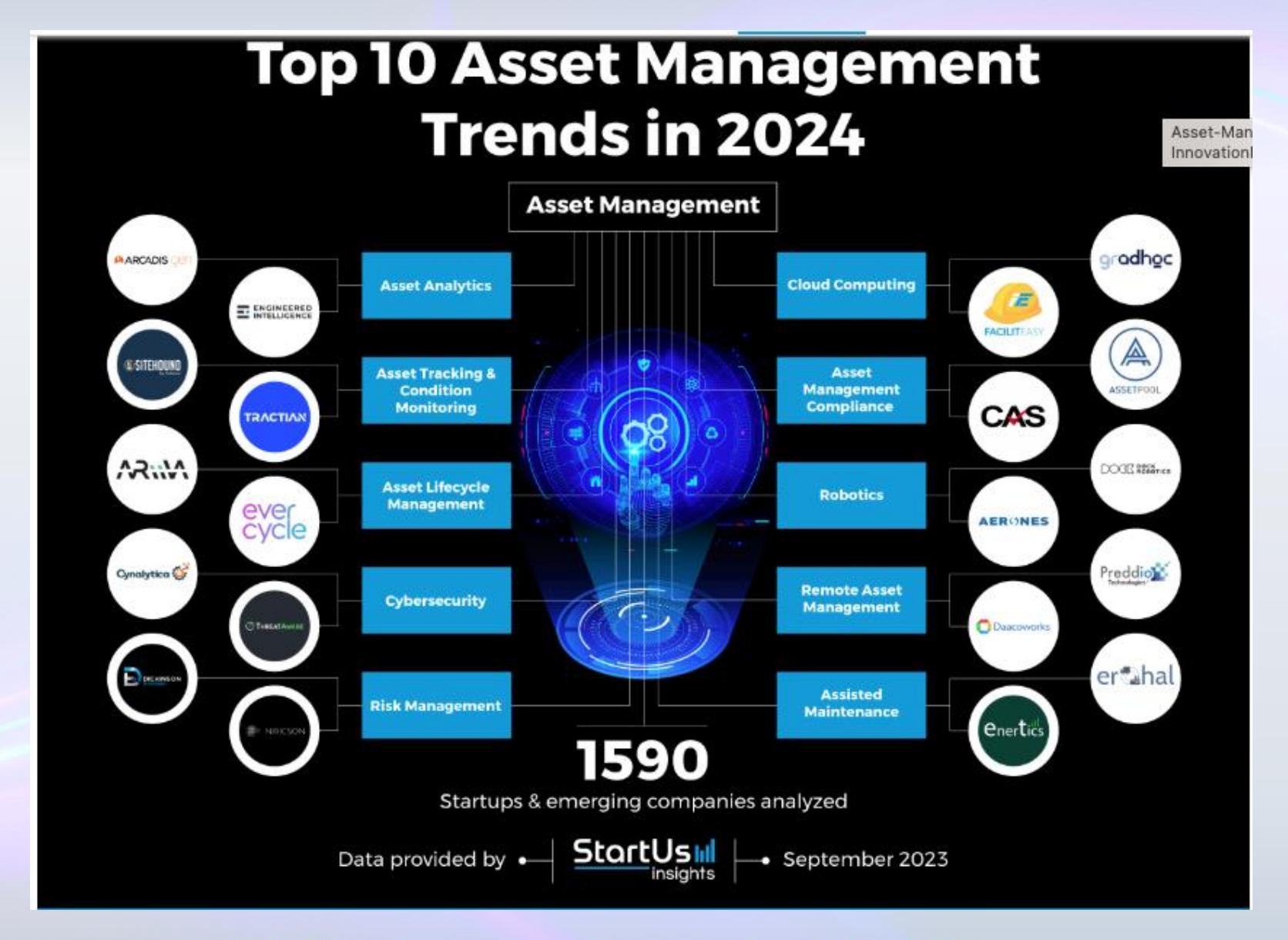
Digitization - Excellence - Sustainability